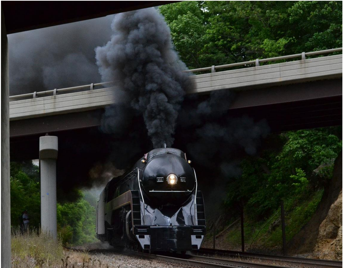
Contemporary Steam Railroading - Color First Place N&W J 611 working Christiansburg Mountain west of Roanoke, May 28, 2017 on former N&W track