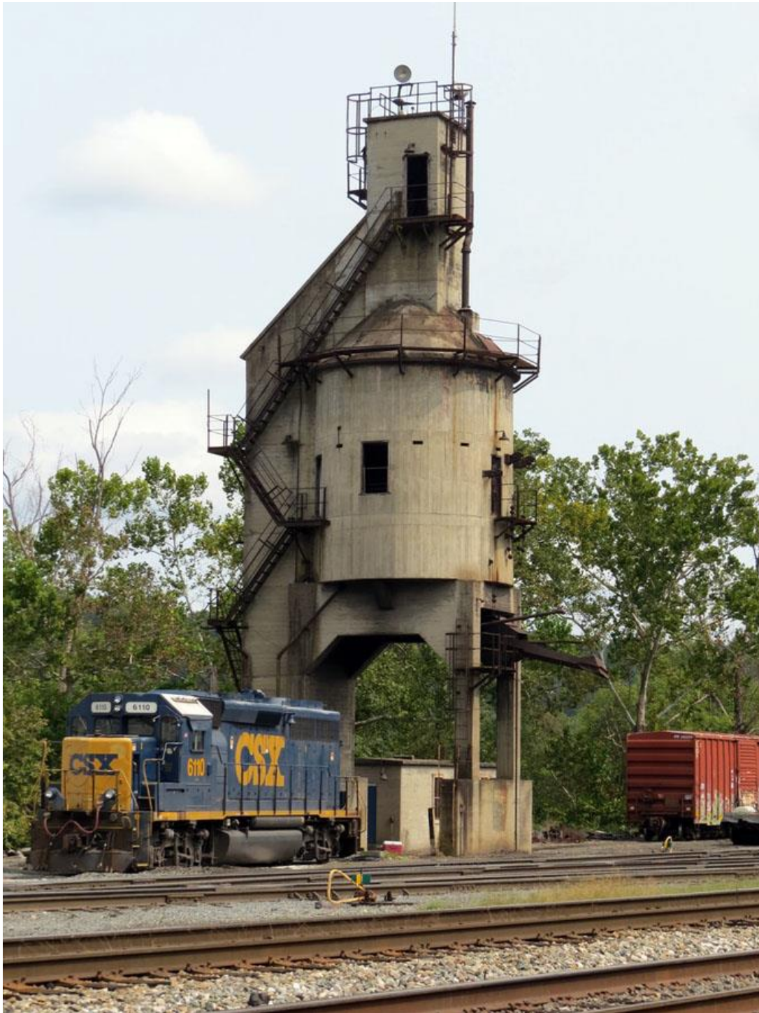
Contemporary Miscellaneous Railroad Subjects - Color Runner Up CSX GP40-2 No. 6110 parked under historic coal dock at Lynchburg' Sandy Hook Yard, Oct. 6, 2020