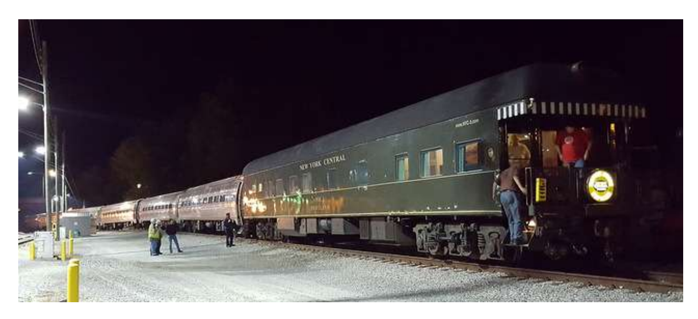
Nov. 6 - Private car NYC 3 spent the first weekend in November in Lynchburg. Pictured above is the Lynchburg Regional, train 145 coupling up to the car prior to its Monday morning departure. It arrived Friday night, Nov. 4. (G. Harper)