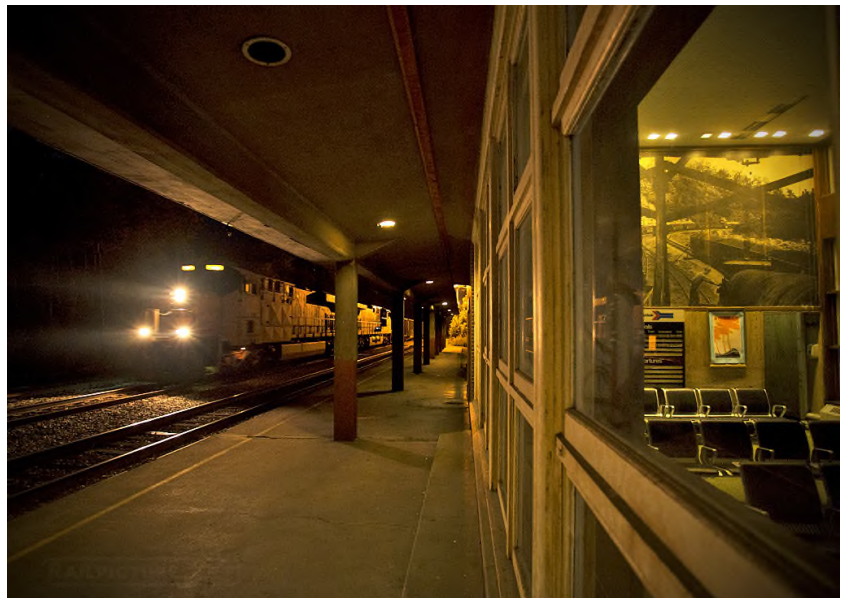
A scene at Prince, WV.

As a young photographer from Charleston's suburban chemical-driven town of Nitro, I've been fortunate enough to have the C&O Railway mainline essentially in my backyard, during a transitional era from old infrastructure to new, modern-day universal signaling infrastructure. The evolution of technology has created for newer hardware and the unique characteristics distinctive to the C&O and its contracted engineers are falling victims to this technology. In an effort to document the final years, I've joined with a small group of dedicated like-minded photographers to venture into the darkness, documenting these relics in the most obscure locations across beautiful West Virginia, exclusively under starlit skies.