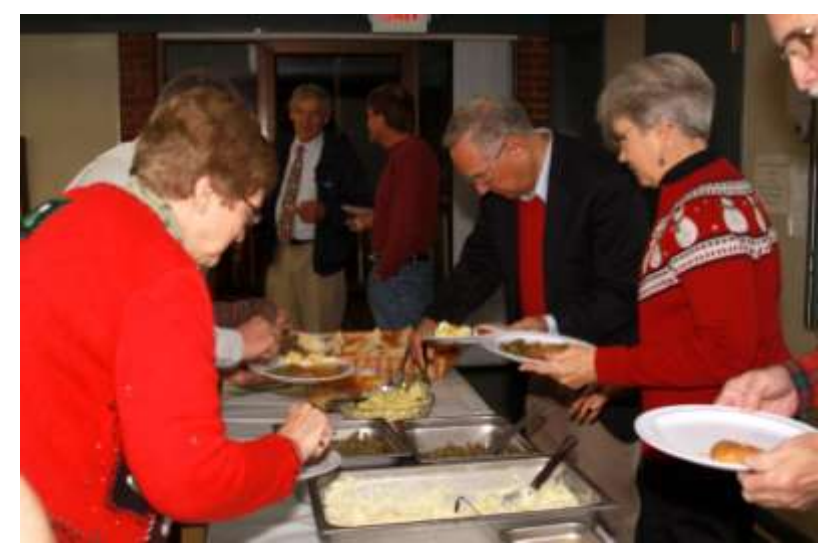
Another fine meal is ready for us to enjoy.