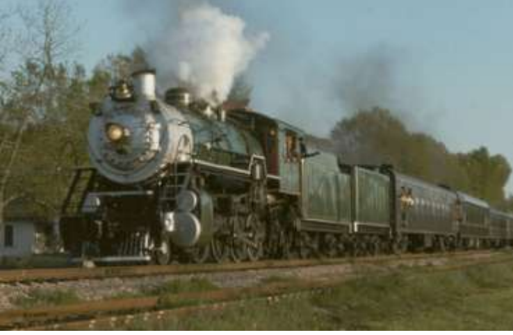
SOU 722 Jonesboro, GA. June 12, 1975.