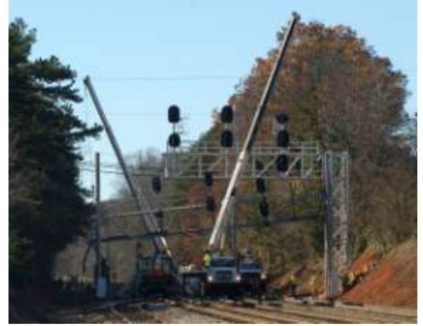
Above: Old signal bridge at Hurt comes down.

Work for the past year or so has been underway restoring a section of double track on the former Southern Ry. south of Altavista, VA. between current control points ("plants" as they were once called) Green, MP 202.1, and Smothers, MP 212.0. On November 21 approximately five miles of the new track was placed into service. The control point at Green was eliminated, and a new control point, named Elba, MP 207.2, was established. Once all work is completed the control point at Smothers will be eliminated. This will give NS a 32-mile stretch of double track from Deal, MP 190.0, to White, MP 222.0, and will help eliminate a traffic bottleneck south of the Hurt Connection. Below are some pictures taken that day. Signals compliant with Positive Train Control mandates were placed into service as well.