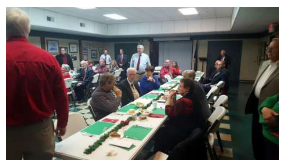
The scene at the banquet.