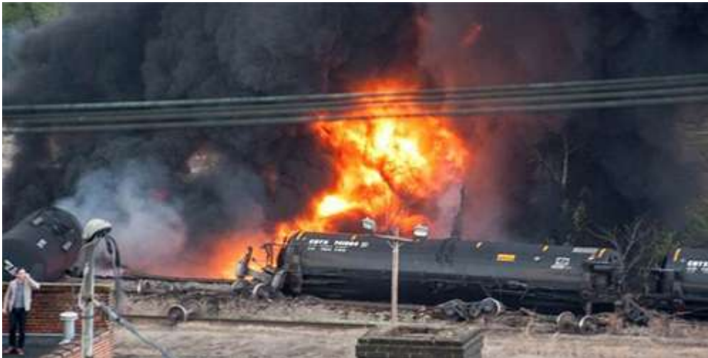
Figure 1. Accident scene.

No injuries to the public or crew were reported. At the time of the accident, it was cloudy and raining lightly; the temperature was 53°F. The CSXT estimated the damages at $1.2 million, not including environmental remediation.