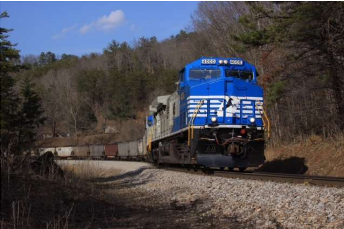
Train Q56 seen earlier near Starkey, VA.